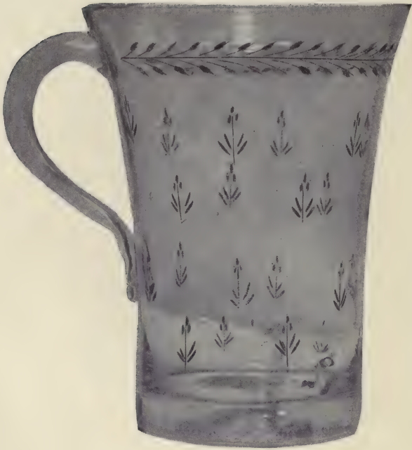
Mug San Ildefonso